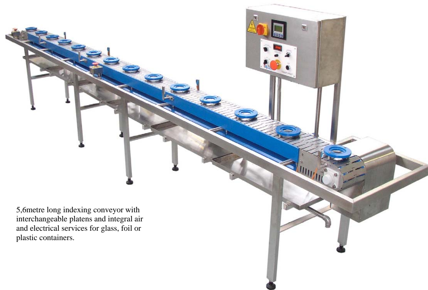
5,6metre long indexing conveyor with interchangeable platens and integral air and electrical services for glass, foil or plastic containers.