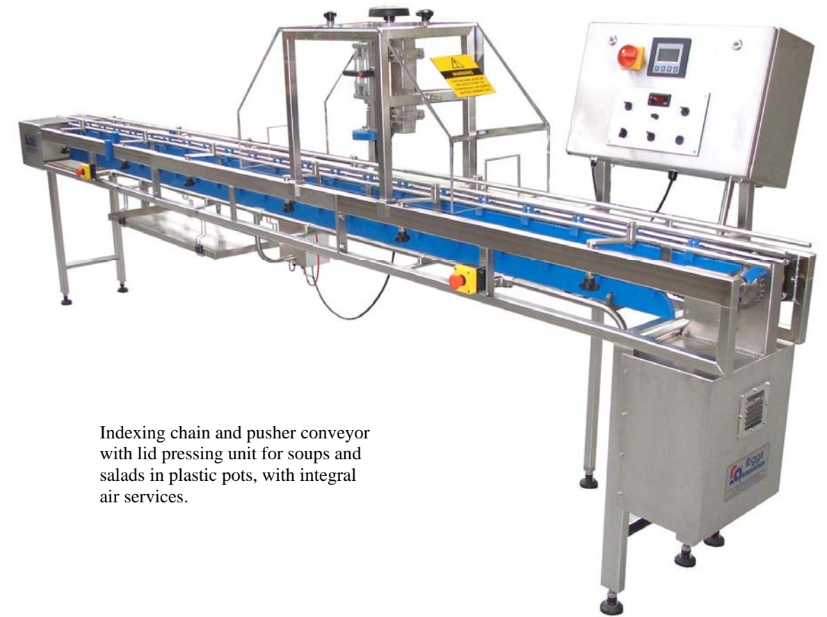
Indexing chain and pusher conveyor with lid pressing unit for soups and salads in plastic pots, with integral air services.